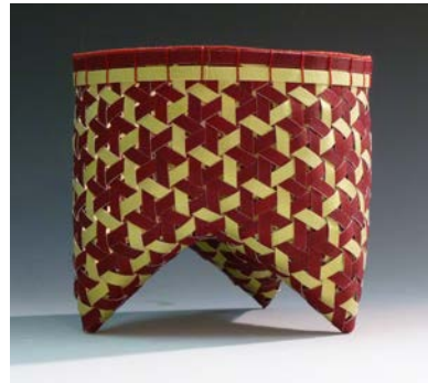
Mint Chocolate - 6 x 7 x 7"

Watercolor paper, acrylic paint – Mad Weave