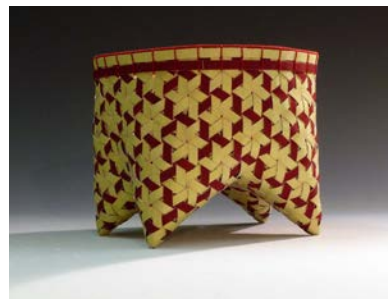
Chocolate Mint - 6 x 7 x 7"

Watercolor paper, acrylic paint – Mad Weave