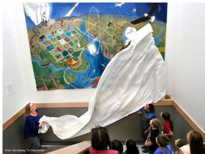
Sacajawea Tapestry (unveiling)