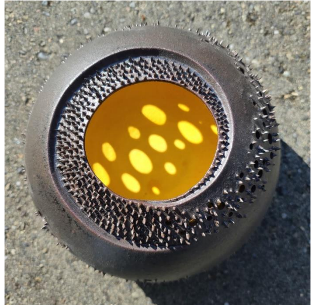
Clockwise: Portrait “Lovely Decay” – series “Edge Reveal” in Yellow - series “Impact” – series