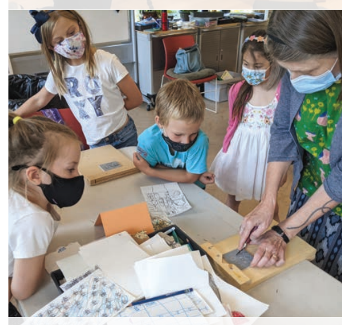
BIMA summer campers learn to cut linoleum for an art project.