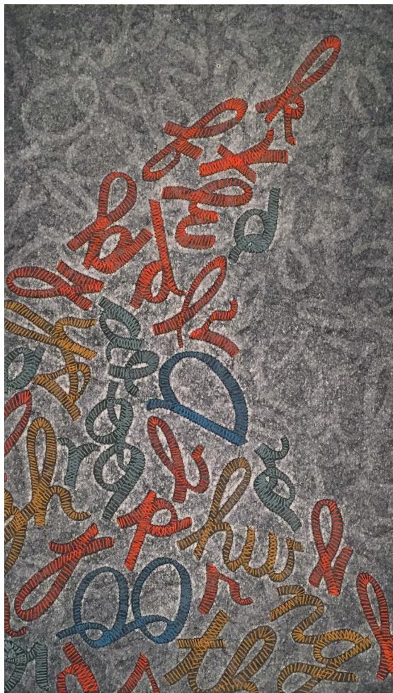
Untitled , 2016 Embroidery on pressure print 12"x18"