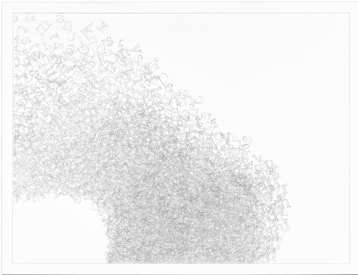
Swarm (Murmuration) , 2022 Graphite on paper 24"x18"