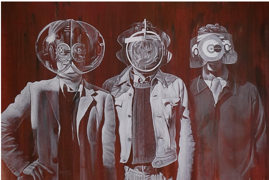
I am no longer afraid to die/Life on mars?, acrylic on canvas 2022

When we view art, the experience is as much of a reflection of our own thoughts and feelings as it is a perception of the art itself. With this relationship in mind, there's a deliberate vagueness to much of my work. My paintings are often based on old photos I find—little glimpses of times and people long forgotten. Abstracted and further removed from their context, I leave space for the viewer to find a sense of familiarity, like a moment of déjà vu or an unplaceable nostalgia.