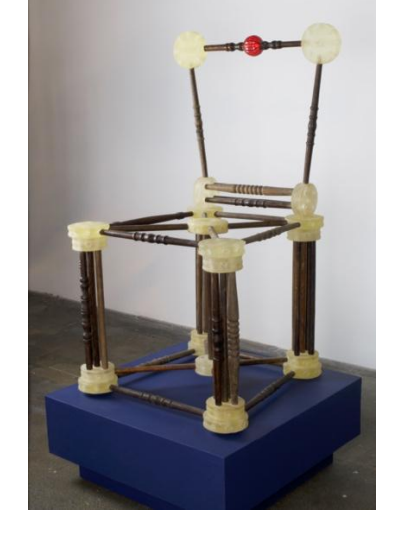
Colonial Disgrace, 2023