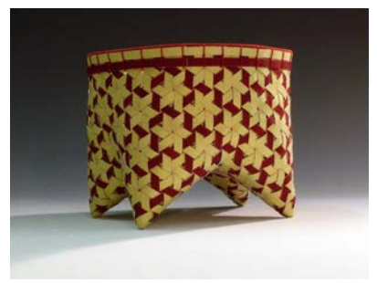
Chocolate Mint - 6 x 7 x 7" Watercolor paper, acrylic paint – Mad Weave