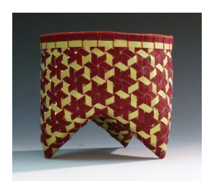
Mint Chocolate - 6 x 7 x 7" Watercolor paper, acrylic paint – Mad Weave