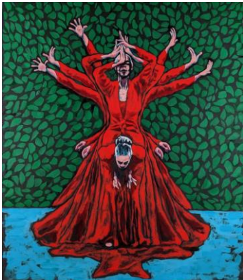
Carmen and The Creation

Bainbridge Island Summer Studio Tour / Bainbridge Island, WA