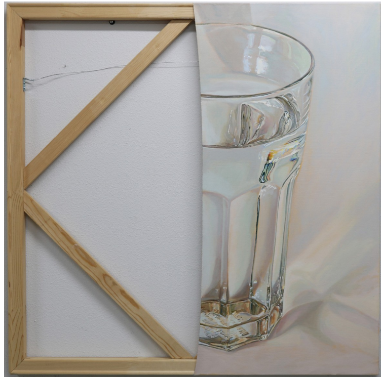
Optimist's Perspective , oil on canvas, 36"x36", 2022

The paintings included in Spotlight are from the series Loveliness and Isolation . They are an exercise in stillness and an attempt to find peace. In my search for peace I turned off the chatter of electronic devices and looked inward and towards the natural world. These were painted using traditional oil painting techniques, by building up multiple layers of paint. This method of painting is really meant for in person viewing as it cannot be replicated on a screen.