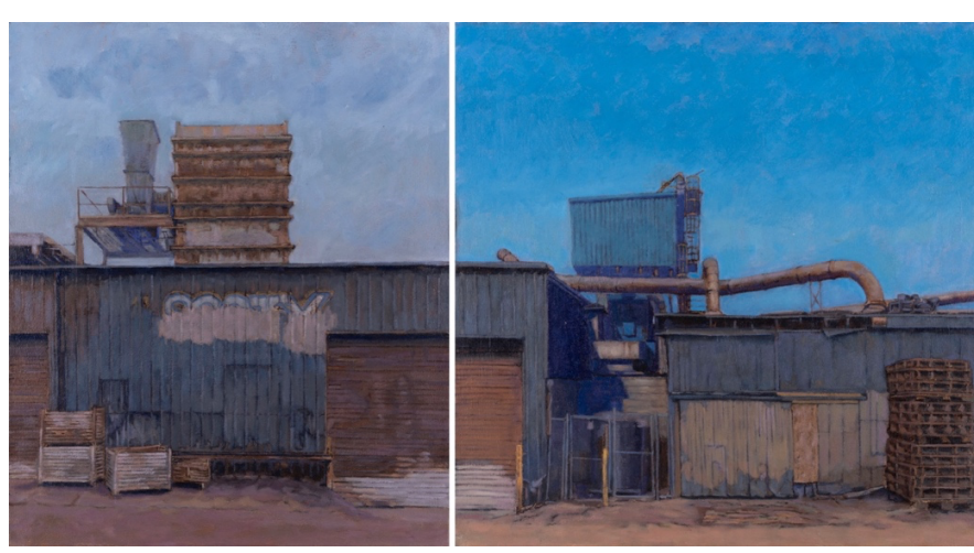
"Cloudy and Clear", oil/canvas, 24 x 44 inches

Web: furiya.com Instagram: Instagram.com/kevenf Email: kfuriya@furiya.com