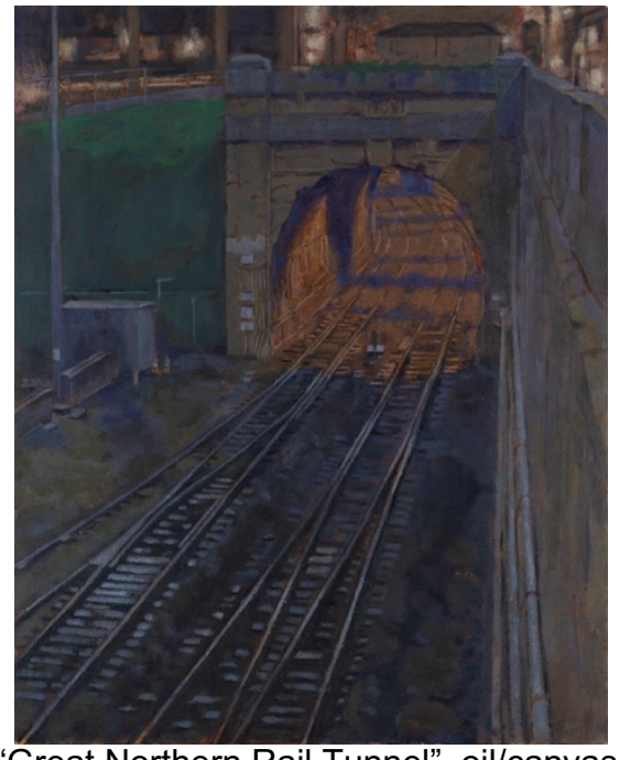
"Great Northern Rail Tunnel", oil/canvas, 26 x 21 inches