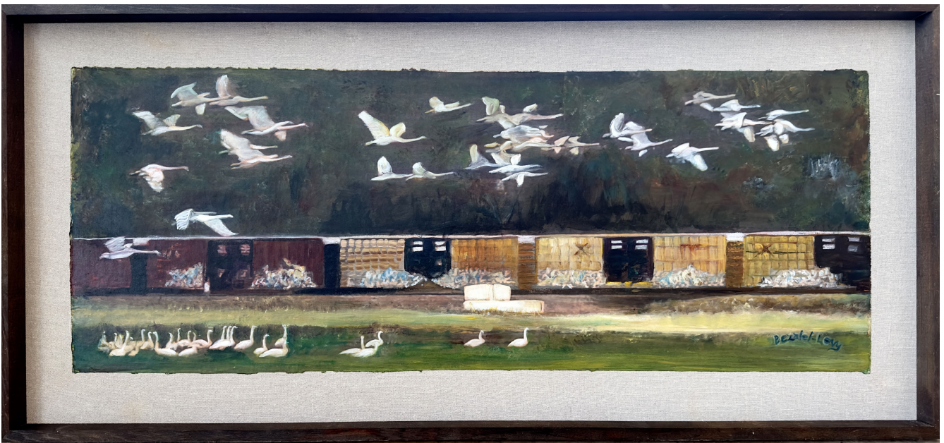
Swans and Freight Train, Stanwood (collection of the artists)