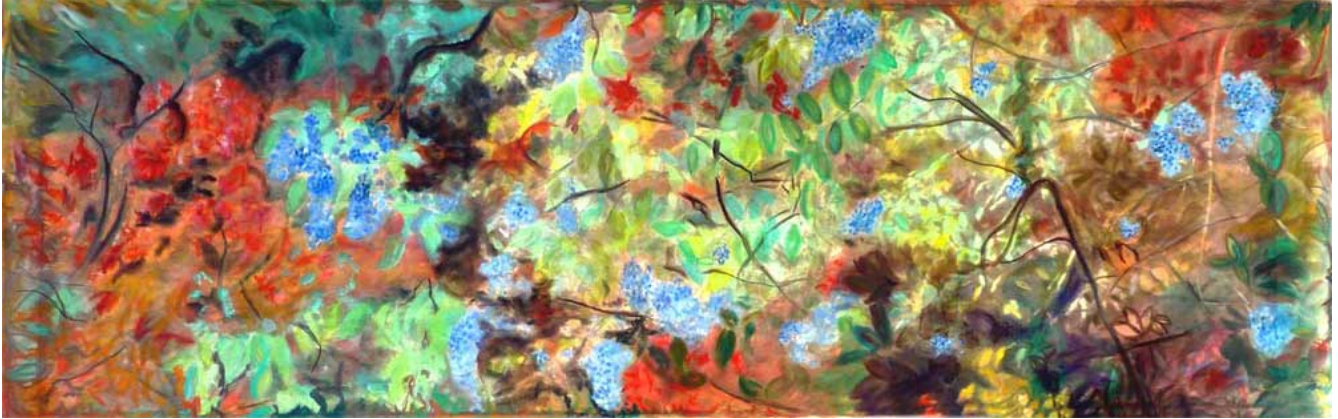
Cascade Autumn, 24 x 96 for Providence Everett Hospital