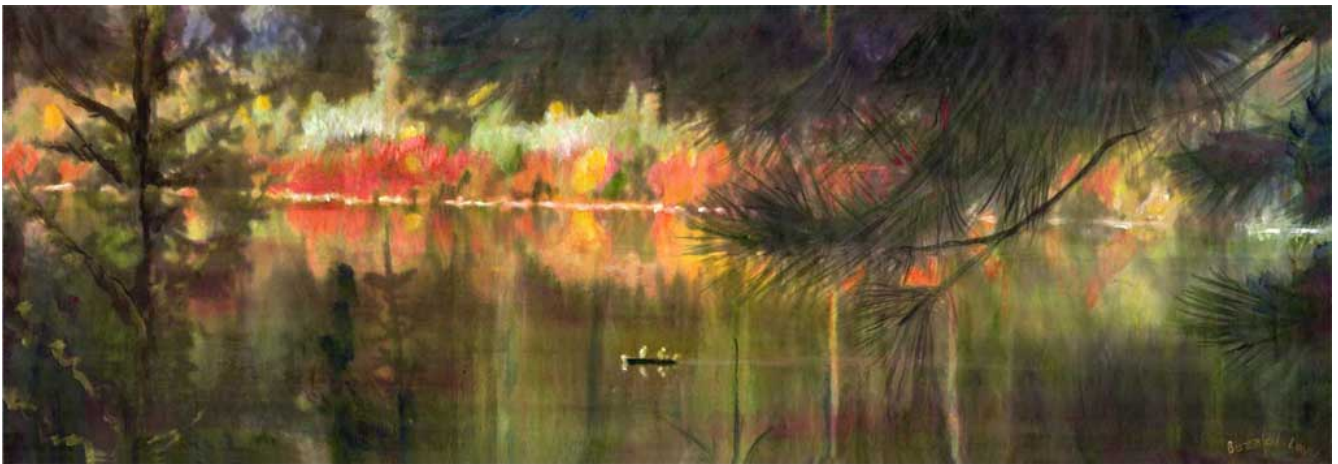
Fishing on Lake Wenatchee, 24 x 70 for Snohomish County Courthouse