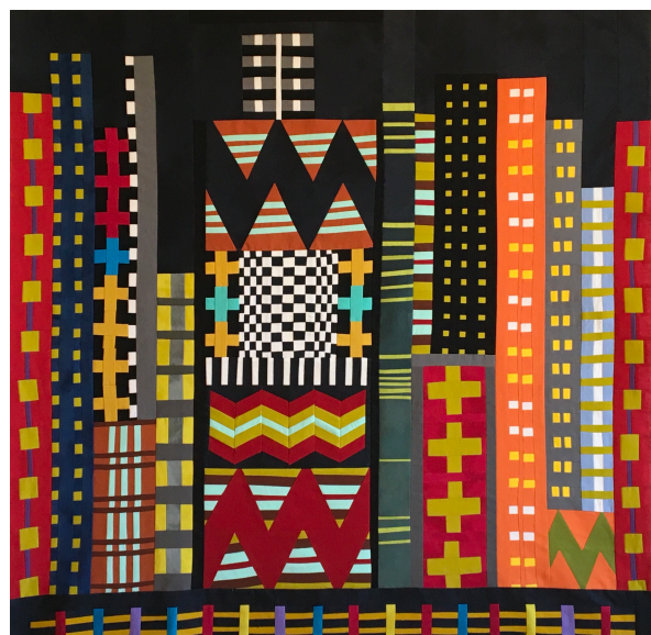
Urban Mayhem 40" x 40" 2022

Upcoming juried exhibitions include SAQA's "Minimalists" exhibit that will travel internationally from September 2023 to December 31, 2026 , and this exhibition, the BIMA's 10th Anniversary Spotlight Group Exhibition which I am thrilled to be a part of!