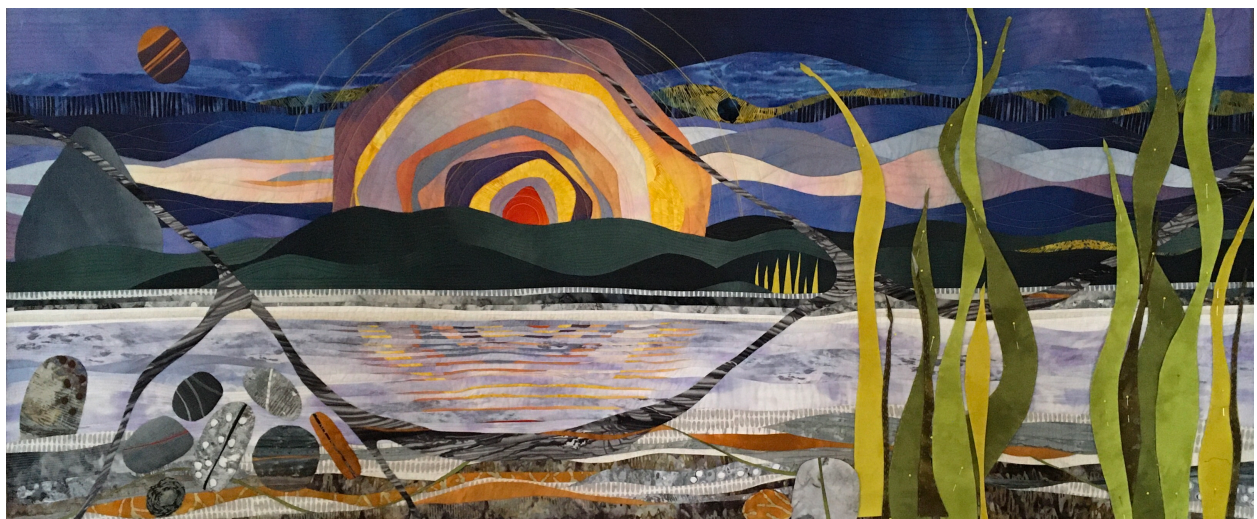
Elements - 31"x78" - 2022

I paint with fabric and “Elements” is an example of my art. I take an idea, abstract the image via sketching, select a pallet of fabric, colors and patterns, use a design wall to place and cut fabric pieces, rearrange and recut until I am happy and then start sewing them together. Once stitched, the top is layered on cotton batting and a backing fabric and “quilted” through all layers. The edges are faced. The top stitching or quilting is an integral part of the design. “Elements” was a commissioned piece for a local couple who love the nature of the Pacific Northwest.