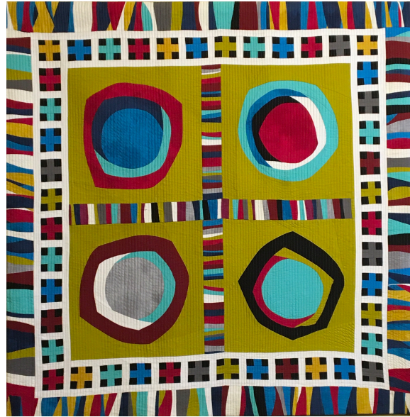
Noughts and Crosses - 40" x 40" 2022