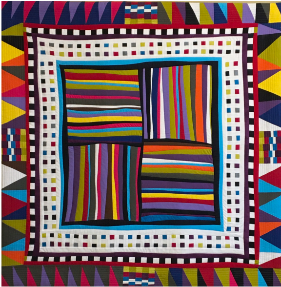
N.S.E.W - 40"x40" 2021