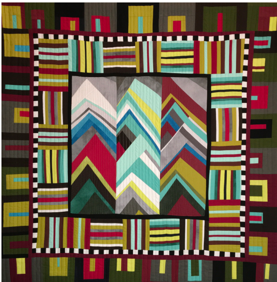
Strata 40"x40" 2021